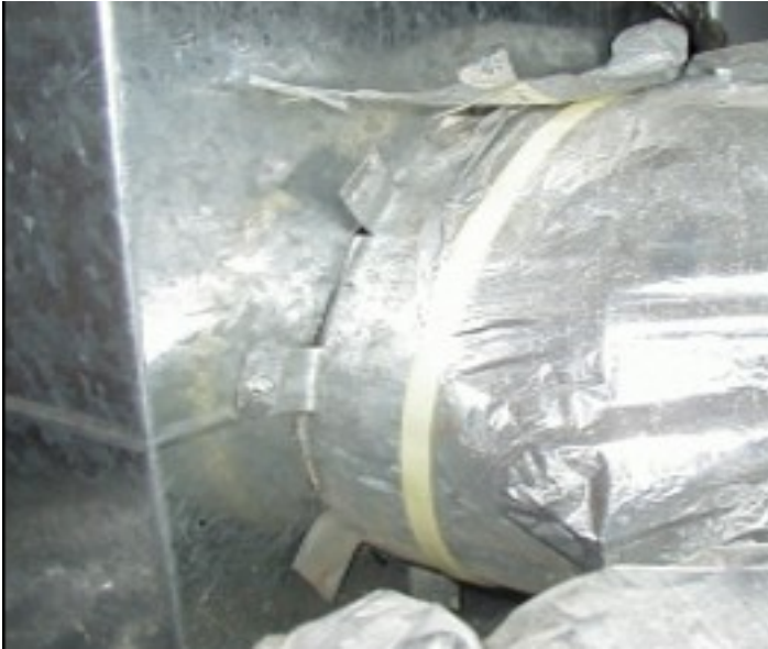
Figure 5: Unsealed tabular duct takeoff