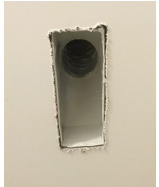
Figure 2: Increased duct and envelope leakage if left unsealed