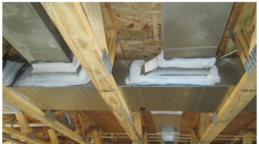
Figure 4: Well sealed supply-to-trunk connection