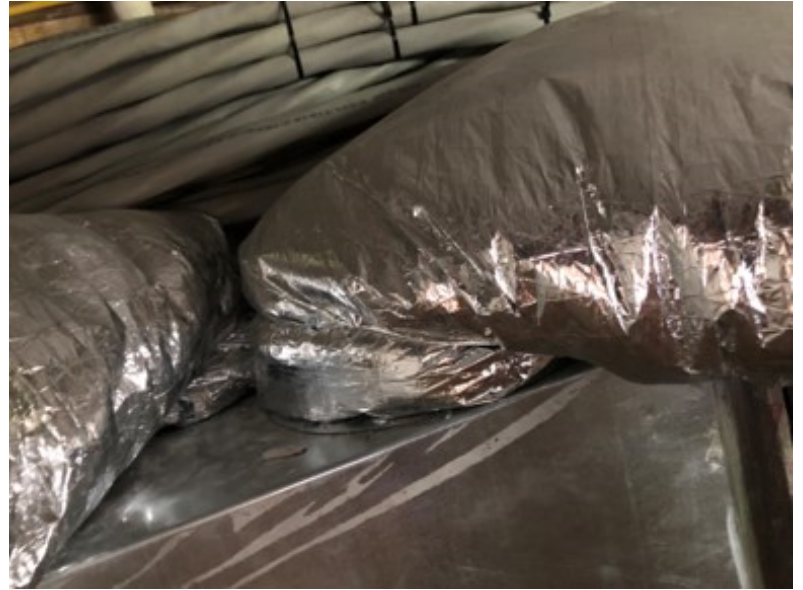
Figure 6: Unsealed and poorly supported duct takeoff