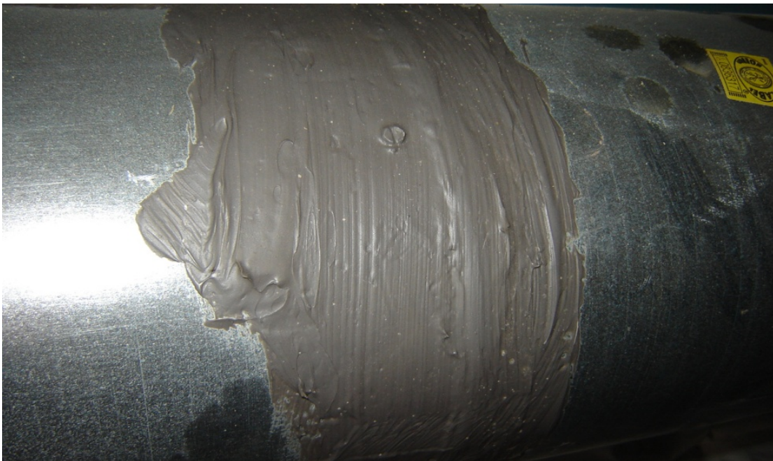
Figure 7: Mastic paste used as permanent seal – “thick as a nickel”